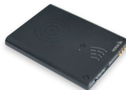
NORDIC ID SAMPO