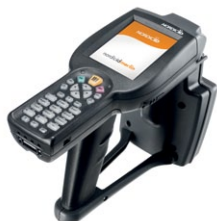
NORDIC ID MERLIN UHF RFID CROSS DIPOLE

The Nordic ID product range covers readers from powerful, pocket-size mobile readers to sleek and robust fixed readers, making Nordic ID readers the best fit for all prerequisites and needs.