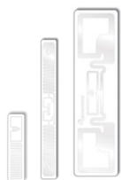
CARRIER LABEL FAMILY