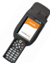
NORDIC ID MERLIN UHF RFID