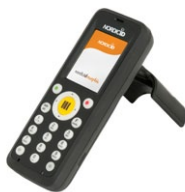
NORDIC ID MORPHIC UHF RFID CROSS DIPOLE