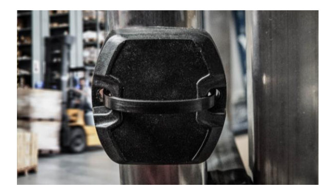
3. High performance acrylic adhesive When mounting the tag with adhesive, clean and dry the surface for obtaining the maximum bond strength.

Plastic or metallic cable ties can also be used for fixing Confidex Viking<sup>TM</sup>. Maximum width of cable tie is 4 mm.